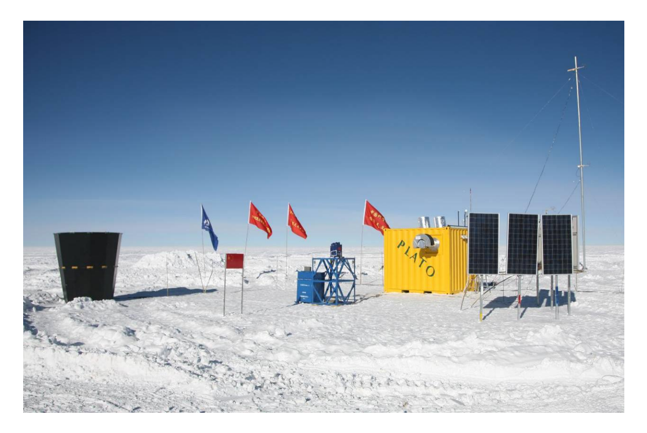
Fig. 2. Picture of the PLATO observatory installation at Dome A station. The PLATO instrument module is centre right surrounded by the solar panel array, the CSTAR telescopes (centre) and the SNODAR instrument (left).

supply for a minimum of one year between servicing. The fuel tank contains enough capacity for greater than nine months of continuous running and is also used to store heat from the engines to help regulate the internal temperature of the module. In addition, each engine is installed with its own bulk oil filtration and recirculation system in order to extend the required servicing interval from the nominal 200 hours of a stock engine, to the ~2000 hours we require.