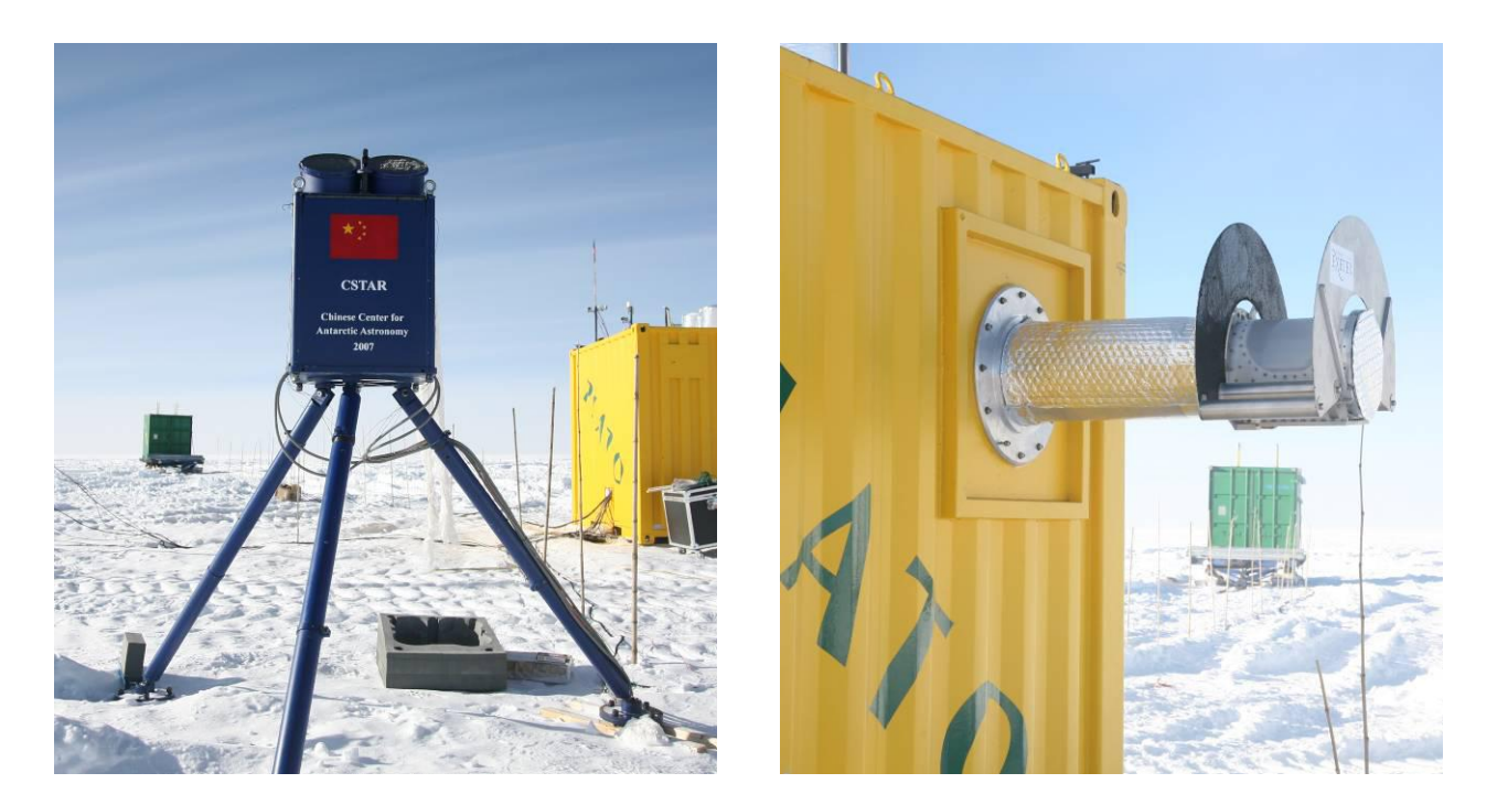
Fig. 3. Left: the CSTAR optical telescope array tripod-mounted on the snow surface. Right: the Pre-HEAT sub-millimetre telescope mounted through the PLATO instrument module side wall. The PLATO engine module is located in the background of both pictures.

Pre-HEAT is designed as a light weight, low power, fully autonomous instrument. It consists of a 0.2 m f/5 parabolic mirror at the end of an enclosed telescope assembly tube which mounts through a port in the PLATO side wall. The mirror scans the sky in elevation and has a co-rotating external (teflon) window. The receiver, a 660 GHz Schottky diode system, is mounted inside PLATO on a sensor assembly unit which also houses the IF processor, IF power detector, and digital FFT spectrometer. Pre-HEAT uses a PC104 single board computer with 8 GB flash disc hard drives.