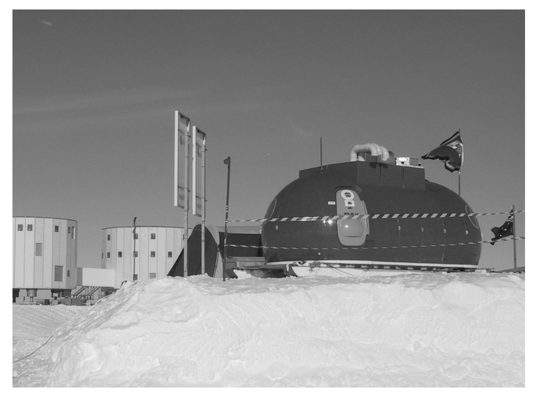
Fig. 1. The AASTINO assembled in front of Concordia station currently under construction

gine that uses compressed nitrogen as its working fluid and burns Jet A1 fuel. It is capable of providing up to 6 kW of heat energy and 900 W of electrical power at full power, but is run at half that level in order to conserve fuel. Engine heat is transferred to the room air via circulation of glycol (at ~60 degrees) through a series of heat exchangers. Electrical power is used to charge a 200 Ahr 24 V battery bank. Two separate, totally independent engines are installed for redundancy. Each engine has its own micro-processor that provides semi-autonmous operation.